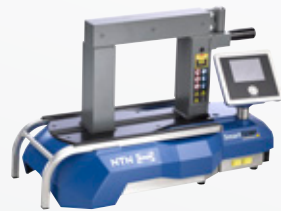
SmartTEMP M 100 kg max