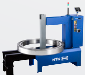
SmartTEMP XXL 800 kg max