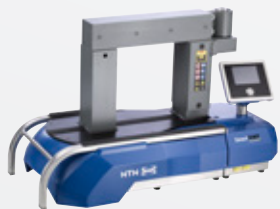
SmartTEMP L 200 kg max