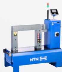
SmartTEMP XL / XL PIVOT 400 kg max