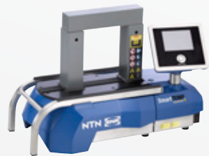
SmartTEMP S 50 kg max

The perfect tool to heat bearings and pinions safely.