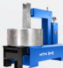
SmartTEMP XXXL 1600 kg max

Example of reference: TOOL SMART TEMP L / induction heater