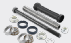
SUSPENSION ARM KITS KS 5

To choose the SNR range is to choose quality and performance.