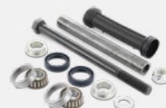
SUSPENSION ARM KITS KS 5

To choose the SNR range is to choose quality and performance.