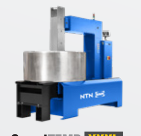
SmartTEMP XXXII 1600 kg max