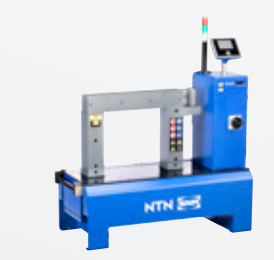
SmartTEMP XL / XL PIVOT 400 kg max