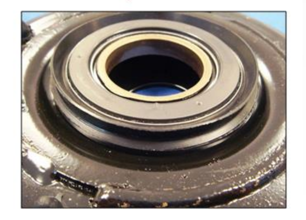
Mounting the seal on the stop