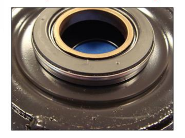
Correct assembly of the stop