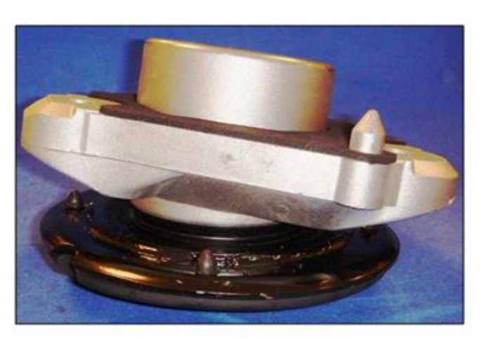
Appearance of the final assembly