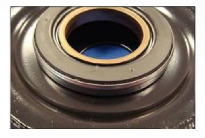
Correct assembly of the bearing