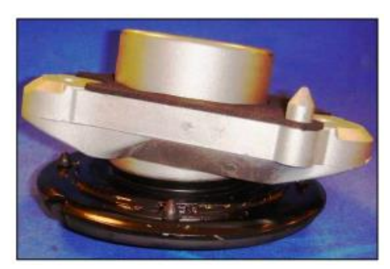
View of final assembly