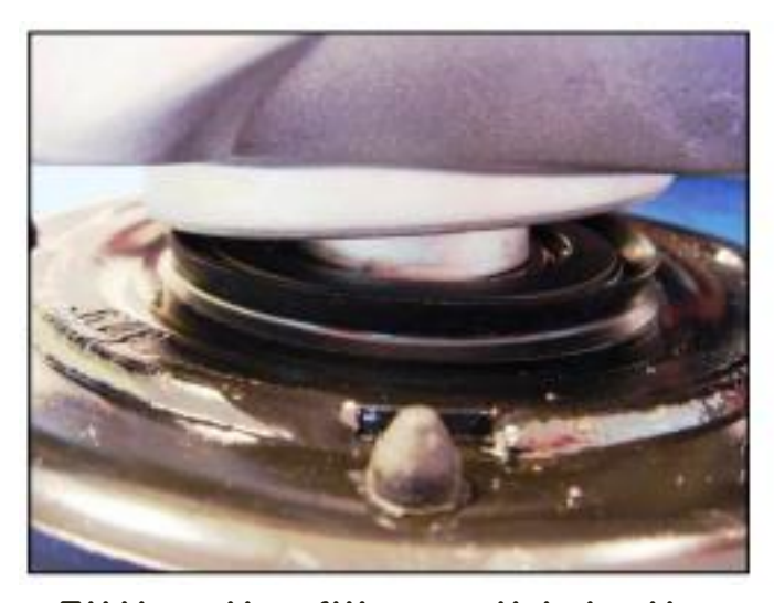
Fitting the filter unit into the mount

Install the seal in the correct orientation: the seal lip goes against the filter unit