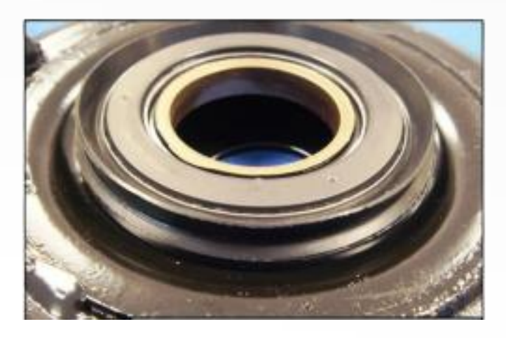
Correct assembly of the bearing Installation of the seal on the prop

Install the seal in the correct orientation: the seal lip goes against the filter unit