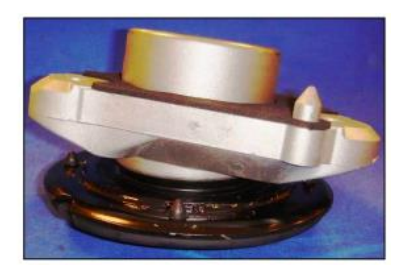
View of final assembly